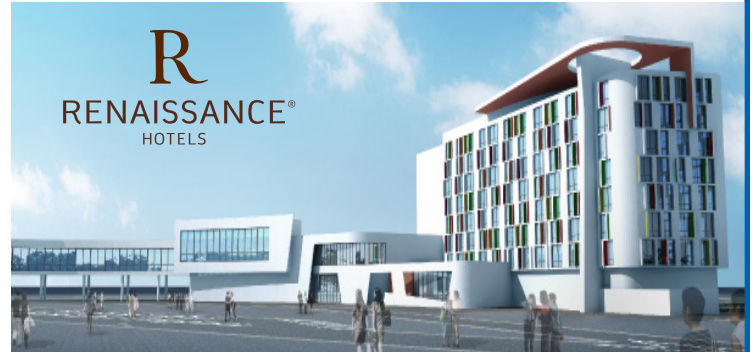
Artist's concept rendering of the new Renaissance Hotel opening in 2014.