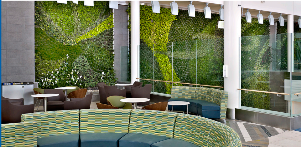
The Living Wall as seen from the new Domestic-International Departures Lounge.