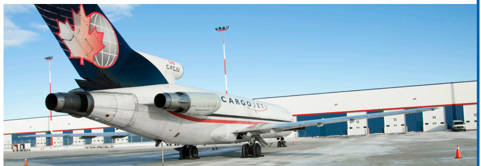
A Cargojet plane outside the hangar in EIA's Cargo Village.

• EIA has been awarded the Leadership in Energy and Environmental Design (LEED®) Gold certification for the South Terminal Domestic/International/Transborder Expansion. This is the first LEED® Gold certification for an airport terminal in Canada.