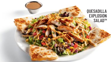
QUESADILLA EXPLOSION SALAD™