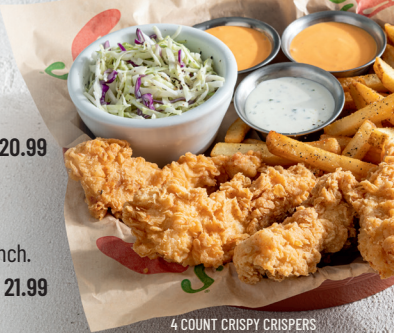
4 COUNT CRISPY CRISPERS