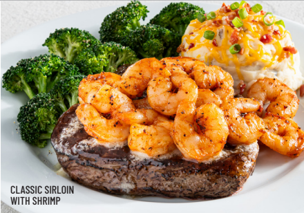
CLASSIC SIRLOIN WITH SHRIMP