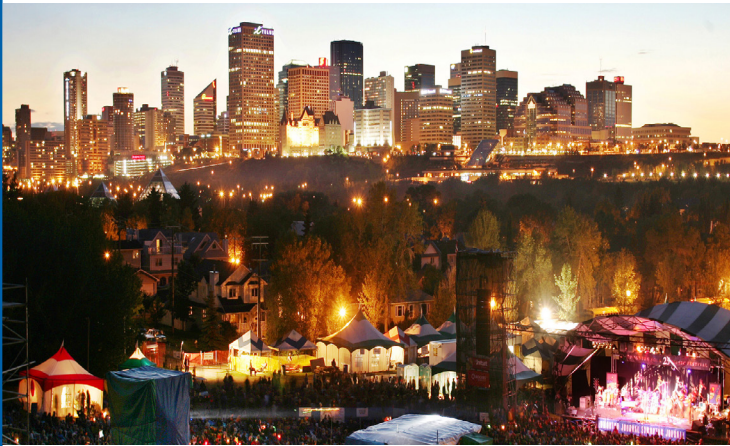
Edmonton skyline as seen from Gallagher park during the Folk Festival.

$500 million a year in funded research, the second highest level in Canada.